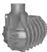
EBL-45 (10 PE)

For installation in groundwater up to middle of tank