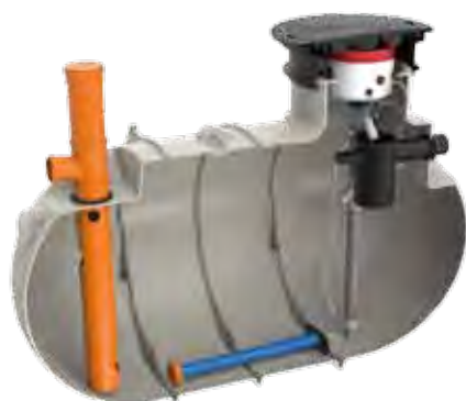
EBL-26 (6 PE)