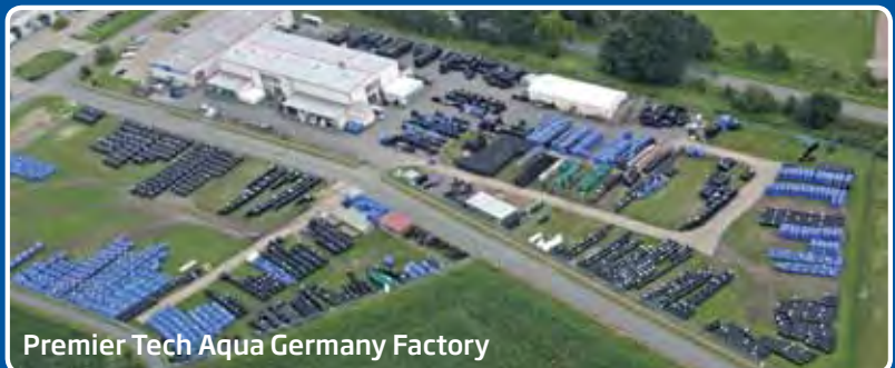
Premier Tech Aqua Germany Factory

Guarantee: The correct installation is the basis for the long life span of your system and for the 25 years of manufacturer's guarantee. This guarantee relates exclusively to the tank and does not cover individual parts and accessories, although these might be included in the price package. The installation of the tank as per installation instructions is the premise for this guarantee. In the case of our acceptance of a fault, we will provide material exchange free of charge - any other services or costs will not be reimbursed. Excluded from guarantee are damages that are caused by abnormal usage or interference, or caused by faulty installation or maintenance procedures. Technical changes and errors reserved.